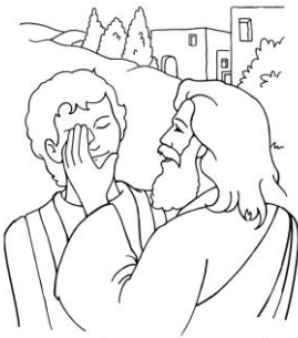
Jesus Heals a Man Born Blind John 9

A few years ago I returned to Carlisle, where I began my teaching career. As I patiently awaited my turn in the Supermarket check-out queue I was